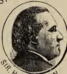
SIR. H.L. LANGEVIN.